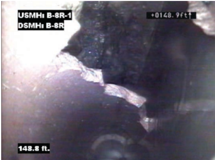
Before: Fractured pipe on Vivian Ct.

The District has 51 full pipe replacements planned in 2022.